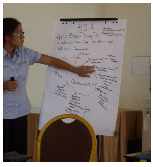
Figure 2.1 Kew Coordinator facilitating a meeting with all key project partners on community questionnaire

In September, all project managers/coordinators met in Yerevan to conduct a workshop regarding the community survey/questionnaire. This was facilitated by the Co-PI, who is a trained facilitator and utilised tools to ensure equal participation from all those involved (Figure 2.1). Partners discussed the questions further with the social scientist and a final version of the questionnaire was shared prior to conducting the interviews. Partners also made the decision on what to include in the project leaflets, suggesting adding a picture and/or name of the target village as they said it would increase the probability that the community members will keep them and pass them along to others.